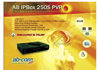
Default welcome screen |