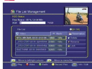
Recording Management |