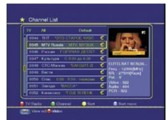
Channel List of SESAT 36 East |