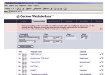
Receiver's web interface |