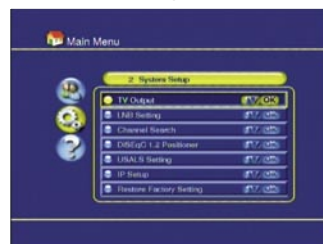
Main Menu |